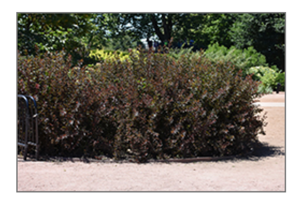
Summer Wine Black Ninebark