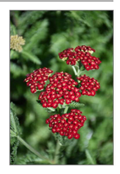
Sassy Summer Sangria Yarrow flowers