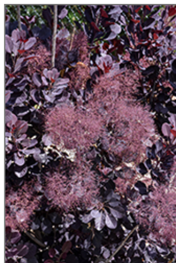
Velveteeny Purple Smokebush flowers