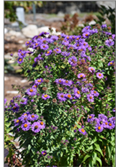
Purple Beauty Aster flowers

This plant does best in full sun to partial shade. It prefers to grow in average to moist conditions, and shouldn't be allowed to dry out. It is not particular as to soil type or pH. It is somewhat tolerant of urban pollution. This is a selection of a native North American species. It can be propagated by division; however, as a cultivated variety, be aware that it may be subject to certain restrictions or prohibitions on propagation.