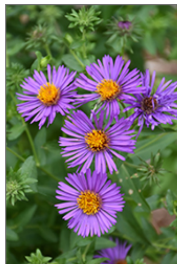
Purple Beauty Aster flowers