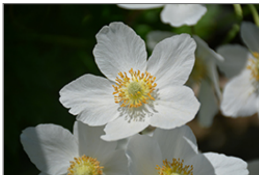
Windflower flowers

Windflower is recommended for the following landscape applications;