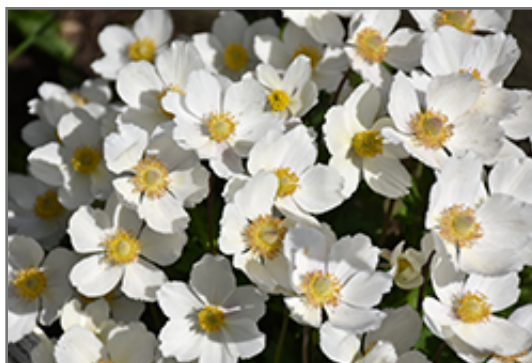
Windflower flowers