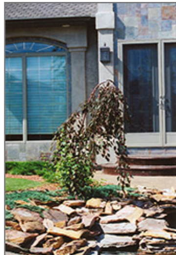
Royal Beauty Flowering Crab