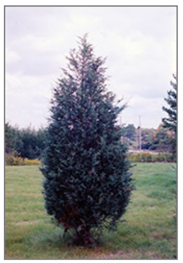
Moffett Juniper