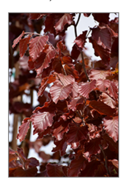
Red Obelisk Beech foliage