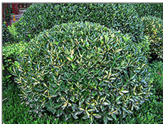
Moonshadow Wintercreeper