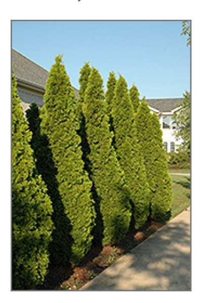
Emerald Green Arborvitae