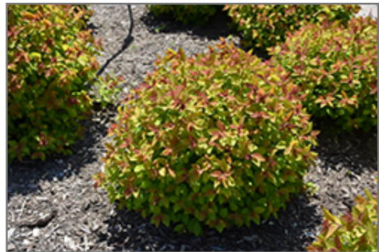
Double Play Big Bang Spirea