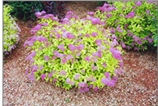
Goldmound Spirea in bloom

This shrub should only be grown in full sunlight. It prefers to grow in average to moist conditions, and shouldn't be allowed to dry out. It is not particular as to soil type or pH. It is highly tolerant of urban pollution and will even thrive in inner city environments. This is a selected variety of a species not originally from North America.