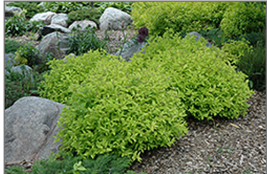
Goldmound Spirea