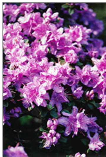
Ramapo Rhododendron flowers

Ramapo Rhododendron will grow to be about 3 feet tall at maturity, with a spread of 3 feet. It has a low canopy. It grows at a slow rate, and under ideal conditions can be expected to live for 40 years or more.