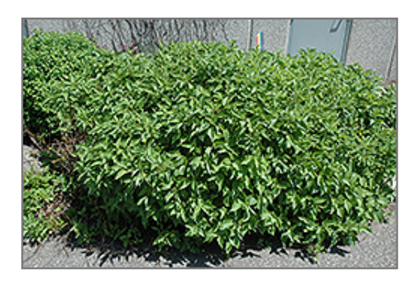
Firedance Dogwood

4590 Bank St. Ottawa, ON, K1T 3W6 phone: 613-822-0383 www.knippelgardencentre.com