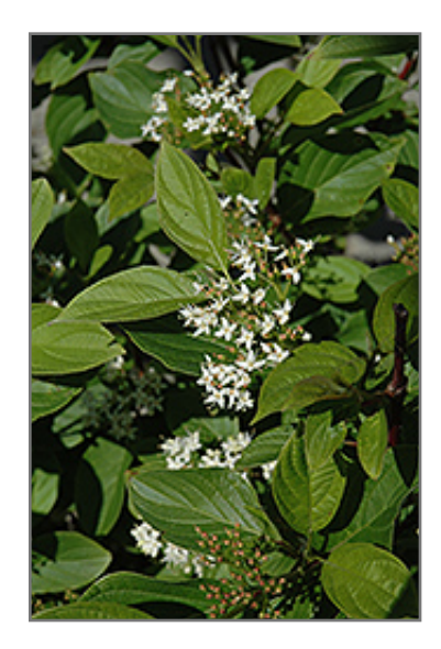
Firedance Dogwood flowers