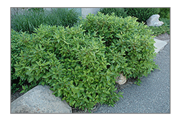
Firedance Dogwood

4590 Bank St. Ottawa, ON, K1T 3W6 phone: 613-822-0383 www.knippelgardencentre.com