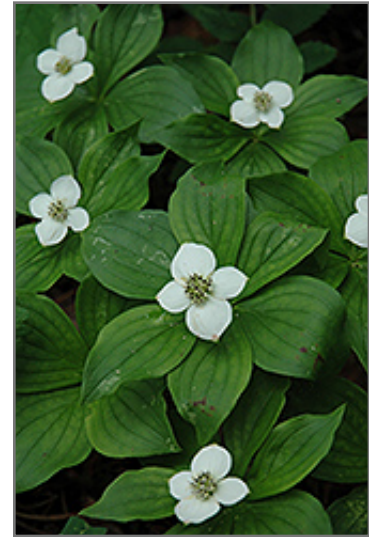
Bunchberry flowers