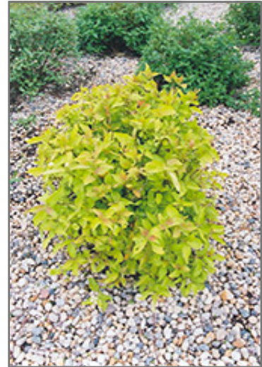
Golden Dogwood