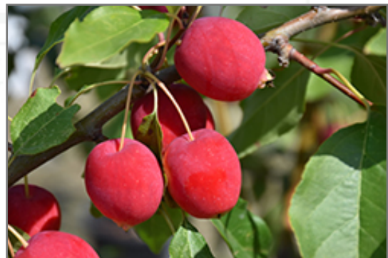
Dolgo Apple fruit