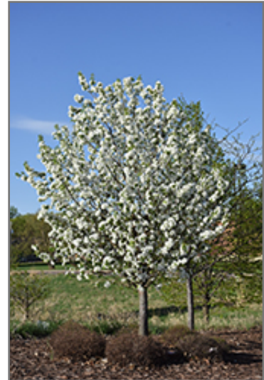
Dolgo Apple in bloom