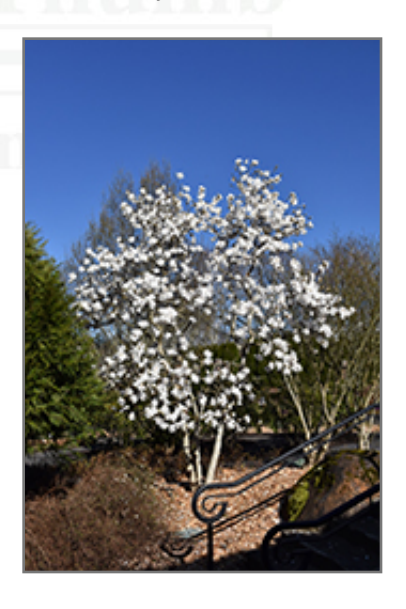
Royal Star Magnolia in bloom