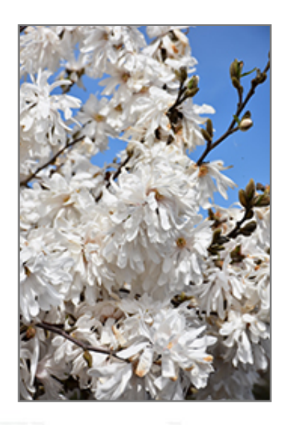
Royal Star Magnolia flowers

Royal Star Magnolia is recommended for the following landscape applications;