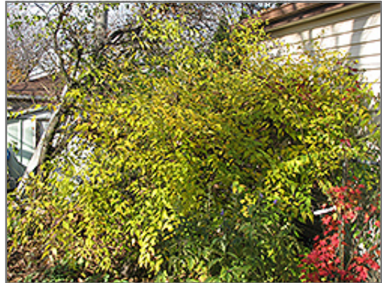
Double Flowered Japanese Kerria in fall

This shrub performs well in both full sun and full shade. It does best in average to evenly moist conditions, but will not tolerate standing water. It is not particular as to soil type or pH. It is highly tolerant of urban pollution and will even thrive in inner city environments. This is a selected variety of a species not originally from North America.