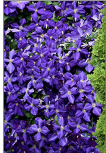
Jackmanii Clematis in bloom

Jackmanii Clematis is recommended for the following landscape applications;