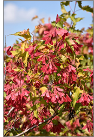
Amur Maple fruit

This tree does best in full sun to partial shade. It is very adaptable to both dry and moist locations, and should do just fine under average home landscape conditions. It is not particular as to soil type or pH. It is highly tolerant of urban pollution and will even thrive in inner city environments. This species is not originally from North America.