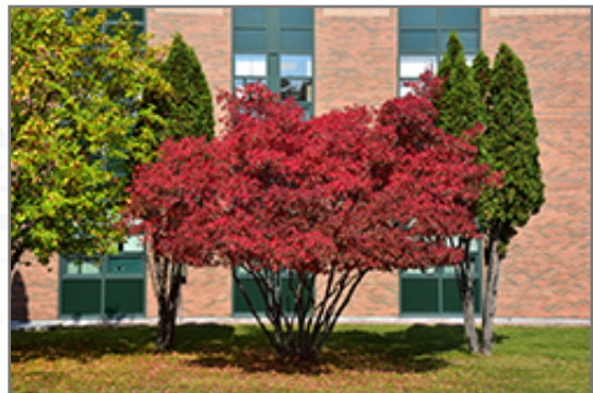
Amur Maple in fall