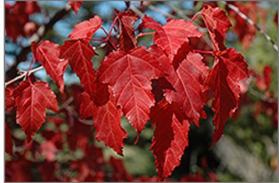
Amur Maple in fall

Amur Maple is recommended for the following landscape applications;