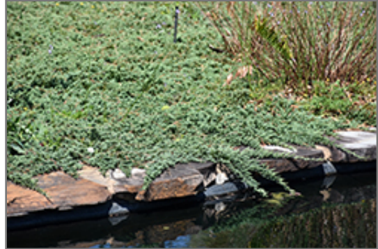
Blue Rug Juniper

This shrub does best in full sun to partial shade. It is very adaptable to both dry and moist growing conditions, but will not tolerate any standing water. It is considered to be drought-tolerant, and thus makes an ideal choice for a low-water garden or xeriscape application. It is not particular as to soil type or pH. It is highly tolerant of urban pollution and will even thrive in inner city environments. This is a selection of a native North American species.