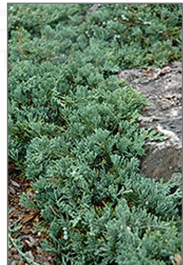
Blue Rug Juniper foliage