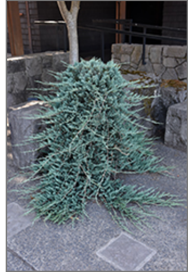
Blue Rug Juniper

This is a relatively low maintenance shrub, and is best pruned in late winter once the threat of extreme cold has passed. Deer don't particularly care for this plant and will usually leave it alone in favor of tastier treats. It has no significant negative characteristics.