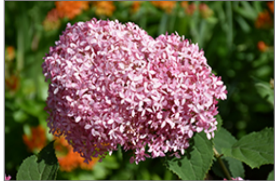
Invincibelle Spirit Smooth Hydrangea flowers