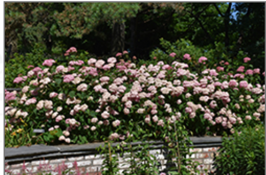
Invincibelle Spirit Smooth Hydrangea in bloom