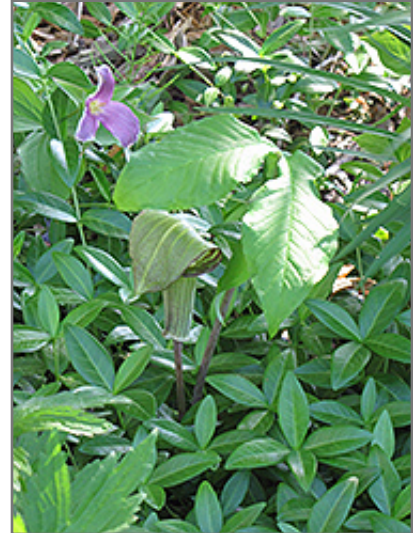
Hybrid Jack-In-The-Pulpit foliage