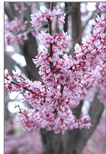
Eastern Redbud flowers