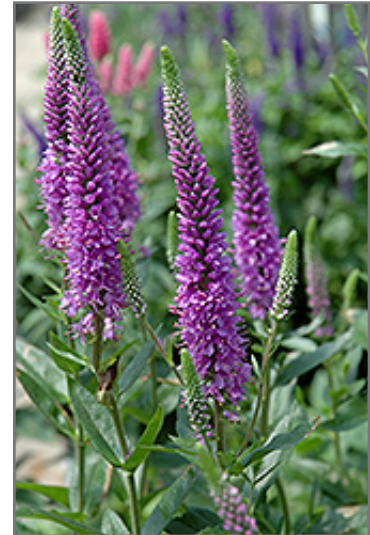
Purpleicious Speedwell flowers

A stunning variety with lovely deep green glossy foliage and magnificent spikes of long lasting radiant purple blooms to dramatically accent sunny borders and rock gardens; deadheading prolongs bloom time