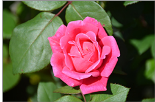
Pink Double Knock Out Rose flowers

This shrub will require occasional maintenance and upkeep, and is best pruned in late winter once the threat of extreme cold has passed. Gardeners should be aware of the following characteristic(s) that may warrant special consideration;