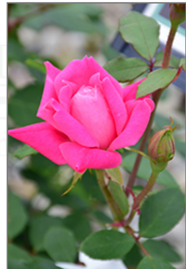
Pink Double Knock Out Rose flowers