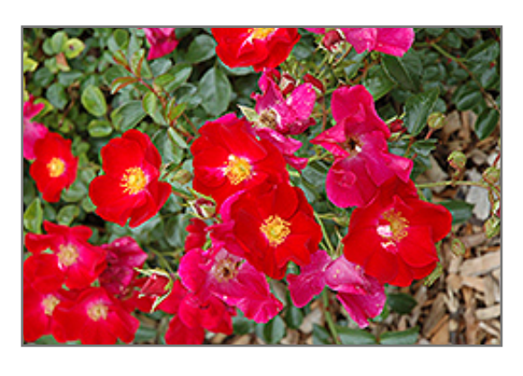
Flower Carpet Red Rose flowers

Flower Carpet Red Rose is a dense multi-stemmed deciduous shrub with an upright spreading habit of growth. Its average texture blends into the landscape, but can be balanced by one or two finer or coarser trees or shrubs for an effective composition.