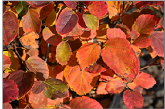
Mt. Airy Fothergilla in fall

Mt. Airy Fothergilla will grow to be about 6 feet tall at maturity, with a spread of 5 feet. It tends to fill out right to the ground and therefore doesn't necessarily require facer plants in front, and is suitable for planting under power lines. It grows at a slow rate, and under ideal conditions can be expected to live for 40 years or more.