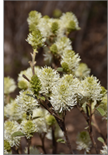
Mt. Airy Fothergilla flowers