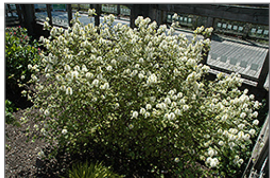
Mt. Airy Fothergilla in bloom