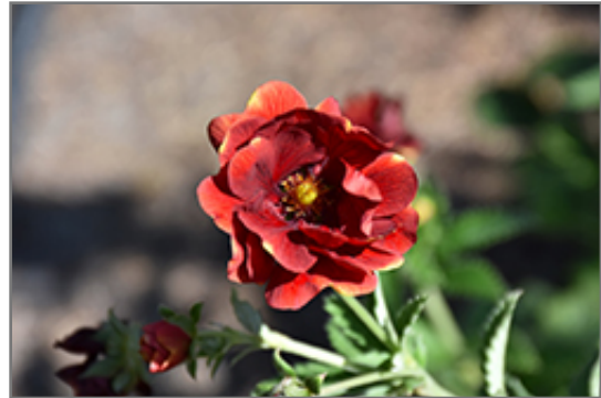
Arc En Ciel Cinquefoil flowers

Arc En Ciel Cinquefoil is recommended for the following landscape applications;