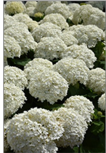
Incrediball Hydrangea flowers

Incrediball Hydrangea is recommended for the following landscape applications;