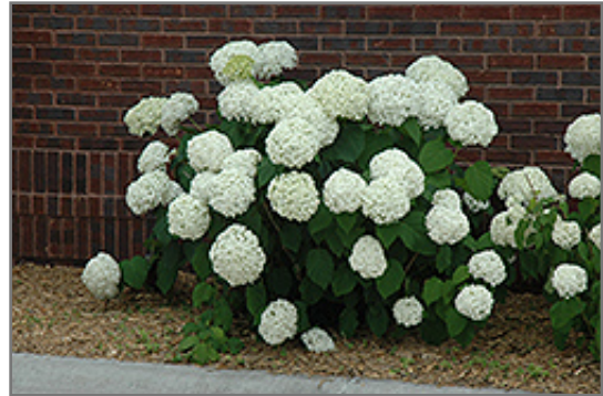
Incrediball Hydrangea in bloom

This shrub does best in full sun to partial shade. You may want to keep it away from hot, dry locations that receive direct afternoon sun or which get reflected sunlight, such as against the south side of a white wall. It prefers to grow in average to moist conditions, and shouldn't be allowed to dry out. It is not particular as to soil type or pH. It is highly tolerant of urban pollution and will even thrive in inner city environments. Consider applying a thick mulch around the root zone in winter to protect it in exposed locations or colder microclimates. This is a selection of a native North American species.