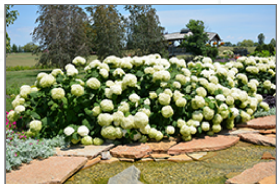
Incrediball Hydrangea in bloom