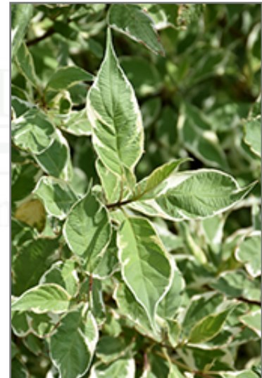
Silver Variegated Dogwood foliage