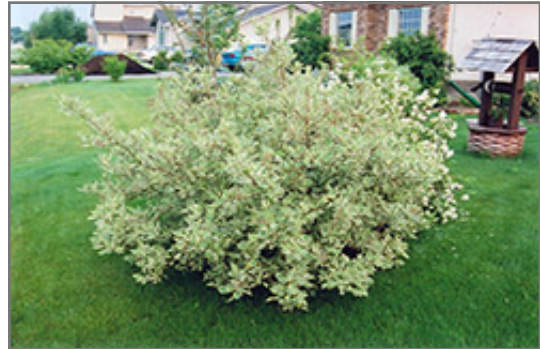
Silver Variegated Dogwood

Silver Variegated Dogwood is recommended for the following landscape applications;