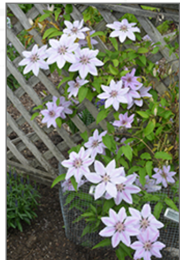
Nelly Moser Clematis in bloom