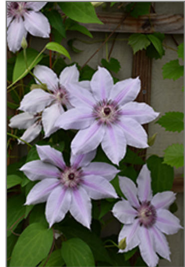
Nelly Moser Clematis flowers

Nelly Moser Clematis is recommended for the following landscape applications;