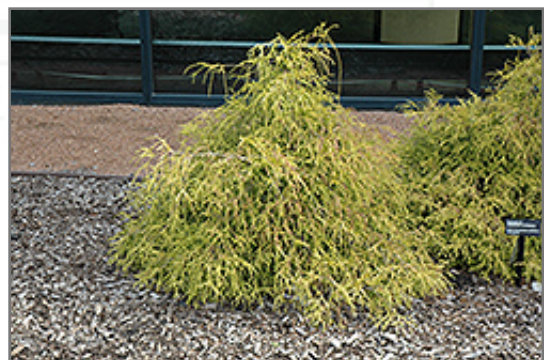
Sungold Falsecypress