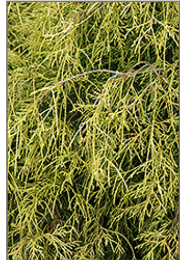
Sungold Falsecypress foliage

This is a relatively low maintenance shrub. When pruning is necessary, it is recommended to only trim back the new growth of the current season, other than to remove any dieback. It has no significant negative characteristics.