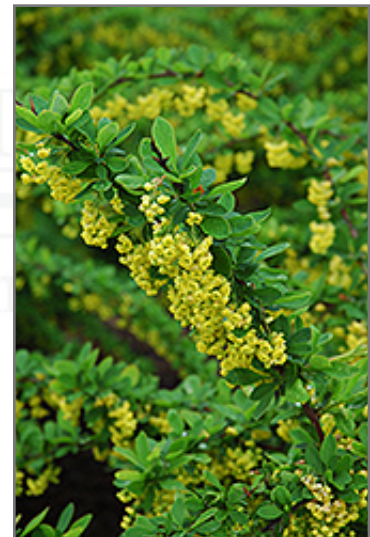
Emerald Carousel Barberry flowers