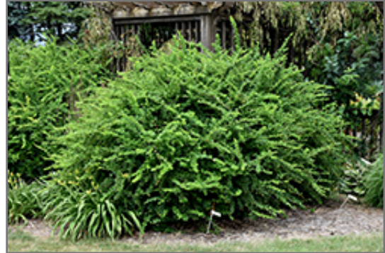
Emerald Carousel Barberry