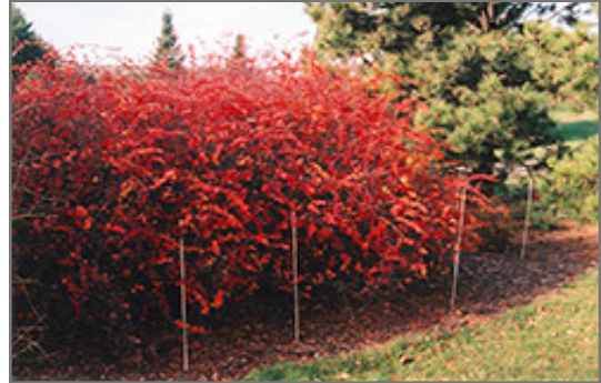
Emerald Carousel Barberry in fall

Emerald Carousel Barberry will grow to be about 5 feet tall at maturity, with a spread of 6 feet. It tends to fill out right to the ground and therefore doesn't necessarily require facer plants in front, and is suitable for planting under power lines. It grows at a medium rate, and under ideal conditions can be expected to live for approximately 20 years.