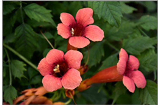
Flamenco Trumpetvine flowers

Flamenco Trumpetvine is a dense multi-stemmed deciduous woody vine with a twining and trailing habit of growth. Its average texture blends into the landscape, but can be balanced by one or two finer or coarser trees or shrubs for an effective composition.