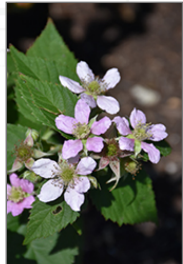
Chester Thornless Blackberry flowers