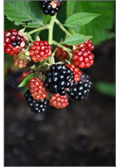
Chester Thornless Blackberry fruit