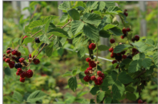
Chester Thornless Blackberry fruit

This shrub may not always play well with others; as such, it is best grown in its own designated garden space or isolated area of an edibles garden. It should only be grown in full sunlight. It prefers to grow in average to moist conditions, and shouldn't be allowed to dry out. It is not particular as to soil type or pH. It is somewhat tolerant of urban pollution. This particular variety is an interspecific hybrid. It can be propagated by division; however, as a cultivated variety, be aware that it may be subject to certain restrictions or prohibitions on propagation.