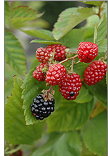
Black Satin Thornless Blackberry fruit

Black Satin Thornless Blackberry has rich green deciduous foliage on a plant with an upright spreading habit of growth. The fuzzy oval compound leaves do not develop any appreciable fall colour. It features an abundance of magnificent black berries in mid summer.