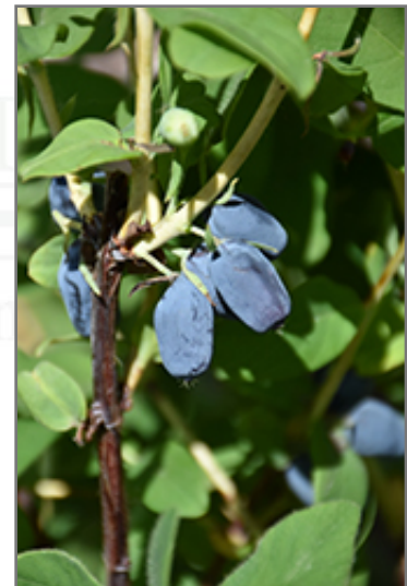
Berry Smart Blue Honeyberry fruit