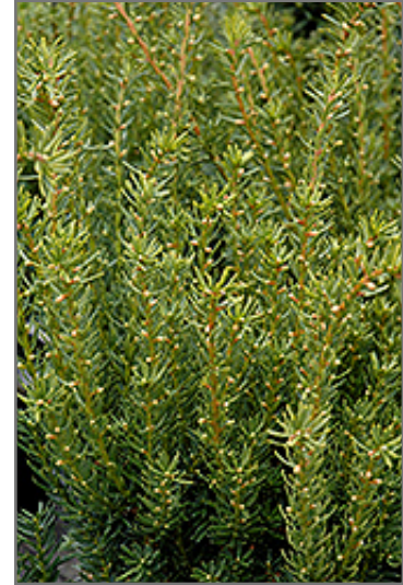
Fairview Yew foliage