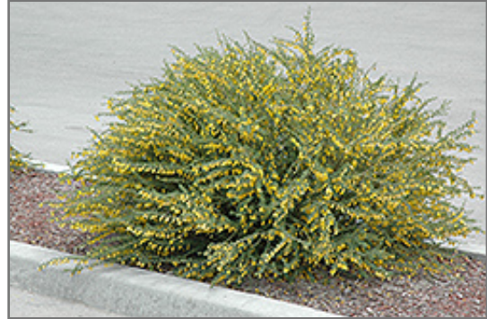
Pygmy Peashrub flowers