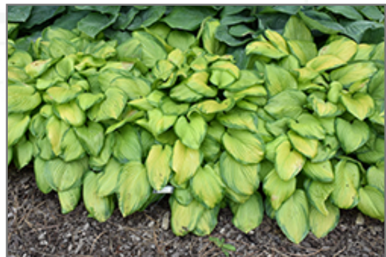
Stained Glass Hosta