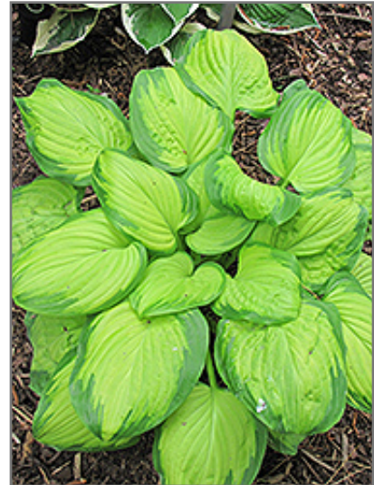
Stained Glass Hosta

Stained Glass Hosta is a dense herbaceous perennial with tall flower stalks held atop a low mound of foliage. Its relatively fine texture sets it apart from other garden plants with less refined foliage.