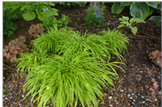
All Gold Hakone Grass