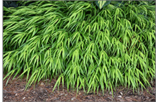
All Gold Hakone Grass foliage

All Gold Hakone Grass is recommended for the following landscape applications;