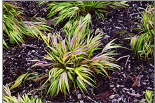
All Gold Hakone Grass in fall

All Gold Hakone Grass will grow to be about 18 inches tall at maturity, with a spread of 24 inches. Its foliage tends to remain dense right to the ground, not requiring facer plants in front. It grows at a slow rate, and under ideal conditions can be expected to live for approximately 15 years. As an herbaceous perennial, this plant will usually die back to the crown each winter, and will regrow from the base each spring. Be careful not to disturb the crown in late winter when it may not be readily seen!