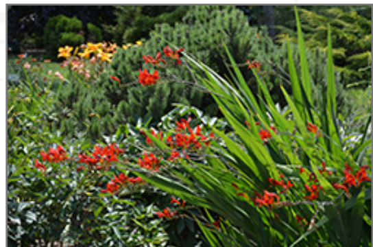
Lucifer Crocosmia in bloom