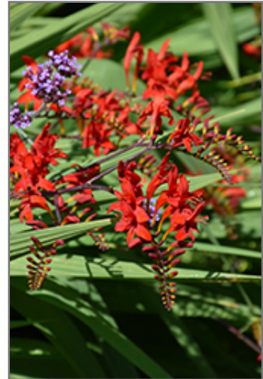
Lucifer Crocosmia flowers

Lucifer Crocosmia is an herbaceous perennial with an upright spreading habit of growth. Its medium texture blends into the garden, but can always be balanced by a couple of finer or coarser plants for an effective composition.