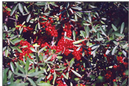
Silver Buffaloberry fruit