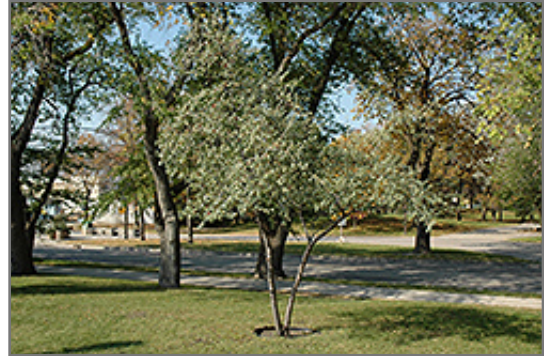
Silver Buffaloberry