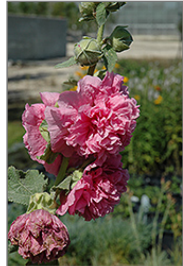
Chater's Double Pink Hollyhock flowers

Chater's Double Pink Hollyhock is recommended for the following landscape applications;