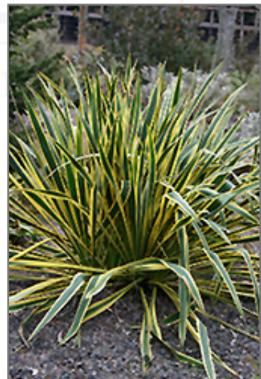
Bright Edge Adam's Needle