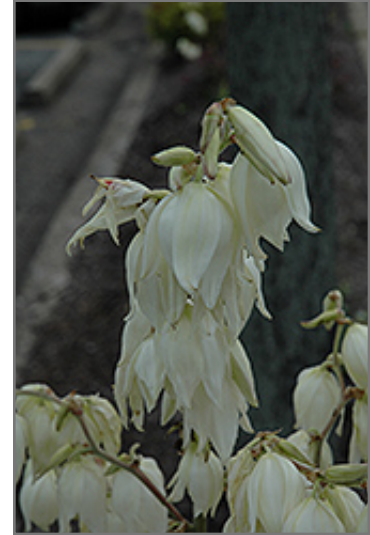
Bright Edge Adam's Needle flowers

Bright Edge Adam's Needle is recommended for the following landscape applications;