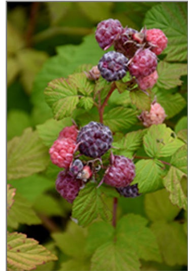
Jewel Black Raspberry fruit

Jewel Black Raspberry has rich green deciduous foliage on a plant with an upright spreading habit of growth. The fuzzy oval compound leaves do not develop any appreciable fall colour. It features an abundance of magnificent black berries from late spring to early summer.