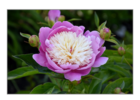
Bowl Of Beauty Peony flowers

Bowl Of Beauty Peony features bold lightly-scented semi-double rose cup-shaped flowers with buttery yellow eyes and creamy white anthers at the ends of the stems from late spring to early summer. The flowers are excellent for cutting. Its compound leaves remain green in colour throughout the season.