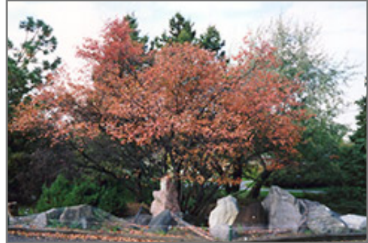
Allegheny Serviceberry in fall

Allegheny Serviceberry will grow to be about 20 feet tall at maturity, with a spread of 15 feet. It has a low canopy with a typical clearance of 4 feet from the ground, and is suitable for planting under power lines. It grows at a medium rate, and under ideal conditions can be expected to live for 40 years or more. While it is considered to be somewhat self-pollinating, it tends to set heavier quantities of fruit with a different variety of the same species growing nearby.